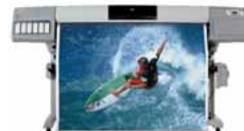
HP Designjet 5000/5500