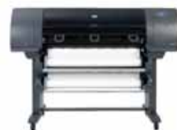
HP Designjet 4500