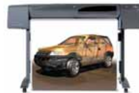
HP Designjet 800