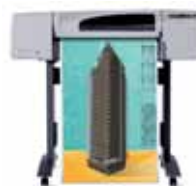
HP Designjet 500