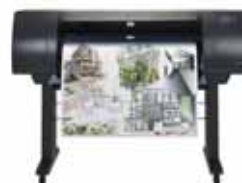
HP Designjet 4000