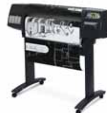
HP Designjet 1000/1055