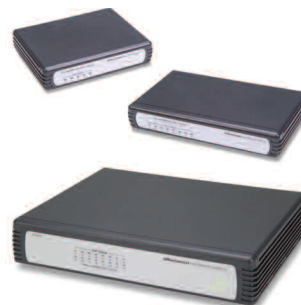
Top to bottom: OfficeConnect Fast Ethernet Switch 5, Switch 8 and Switch 16