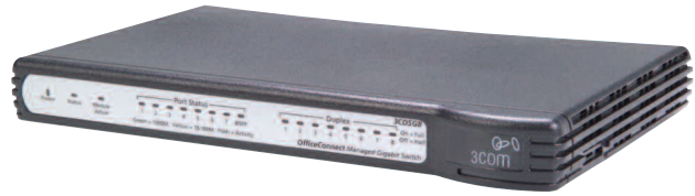
3Com OfficeConnect Managed Gigabit Switch