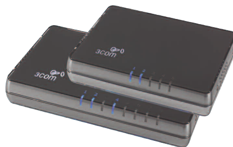
from top: 3Com Switch 5, Switch 8

Compact, streamlined and affordable. The 3Com Switch 5 and Switch 8 10/100 feature an internal power supply, autosensing and auto MDI/MDIX for easy operation.