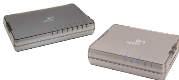
from top: 3Com Gigabit Switch 8, Gigabit Switch 5

Compact, streamlined and affordable highspeed switching with autosensing and auto MDI/MDIX for easy operation